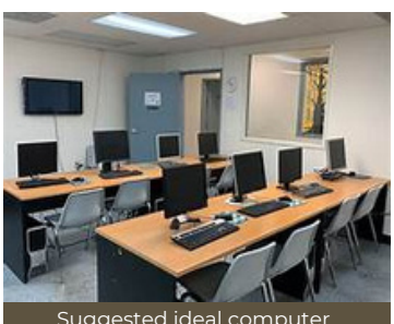
Suggested ideal computer laboratory and library for the Dream Center