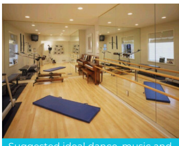
Suggested ideal dance, music and fitness studio for the children and youth.