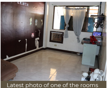
that would become the computer laboratory of the Dream Center.